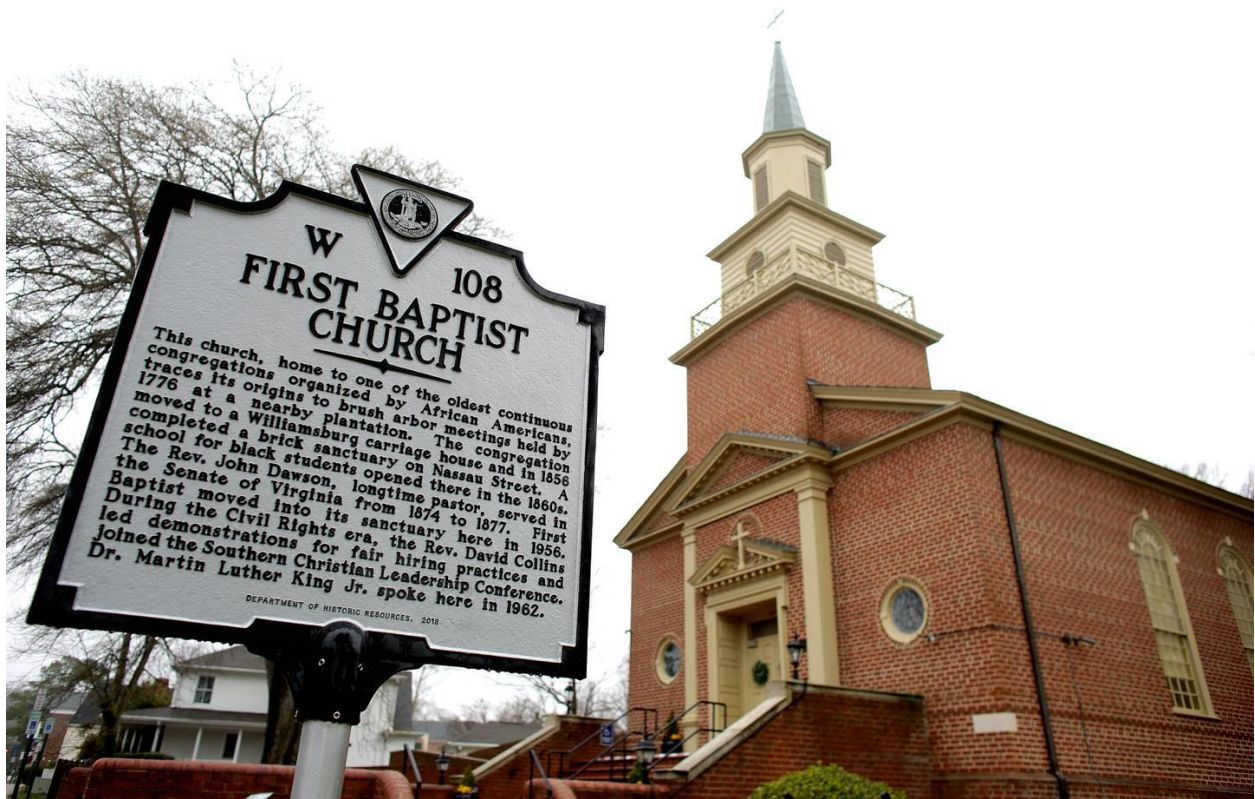
Williamsburg's First Baptist Church

This year, $402,500 was awarded to the 12 organizations. The fund plans to give nearly $2 million over the first five years.