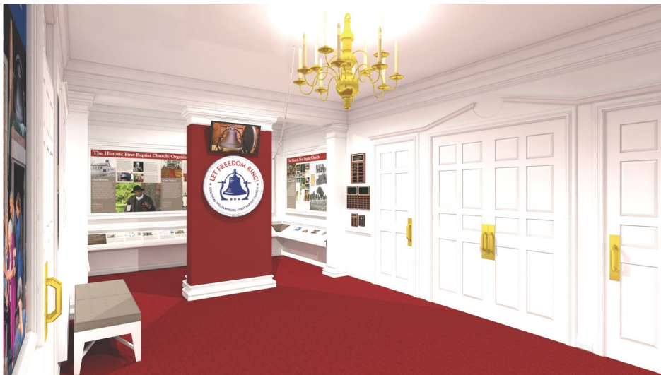
Artist rendering of re-designed entry at First Baptist Church

The artifacts at the Historic First Baptist Church are at some risk of loss and damage until proper storage and display can be achieved. The Foundation members will work with the History and Tour Ministry and a professional team of experts to review the existing space and to determine if there are opportunities for technology updates and modifications to the interior design of exhibit space during 2020. The Foundation will present concept drawings such as the following to the First Baptist Church in 2020 for discussion. There is no anticipated cost for this initiative in fiscal year 2020. The directors will work to obtain a grant and will provide an estimated budget for this project in early 2021.