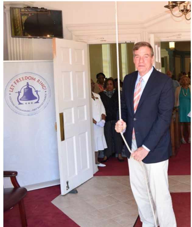
United States Senator Mark Warner worships with First Baptist and rings the Freedom Bell for Justice, Equality and Peace