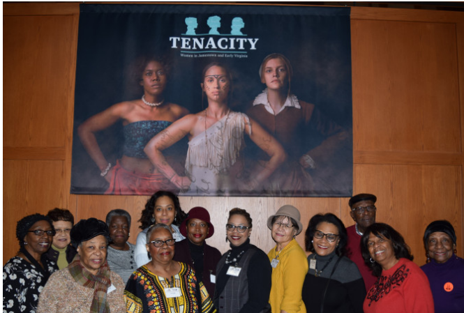
Working in partnership with the Jamestown Yorktown Foundation – February 2019