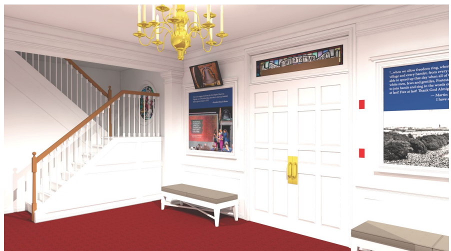
Alternate view of re-designed entryway