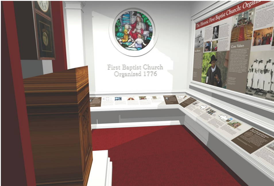
A re-imagined museum space with displays of history and information for tours