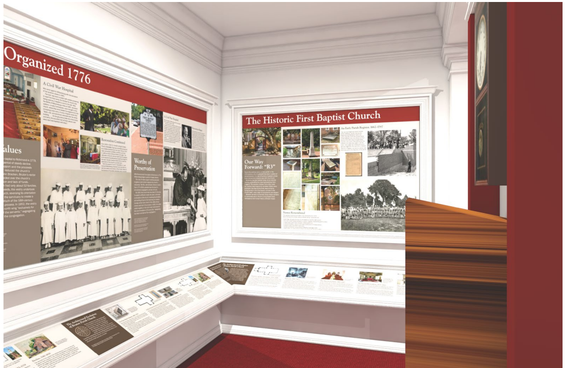
Another view of museum including Nassau Street artifacts