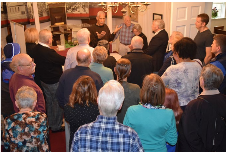
St. Martin's Episcopal Church's annual tour and ringing of the Freedom Bell