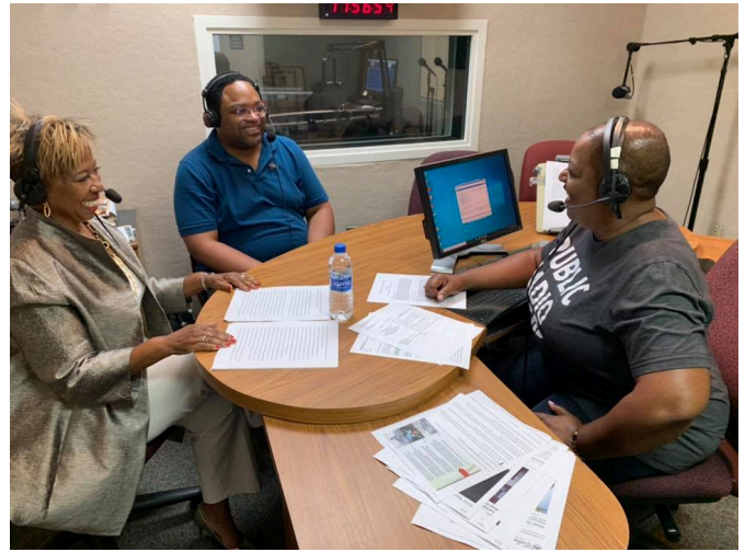
Notifying the public of the Let Freedom Ring's renewed partnership with the Colonial Williamsburg Foundation